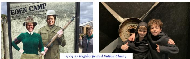
15.04.24 Bugthorpe and Sutton Class 4 Great day out at Eden Camp!